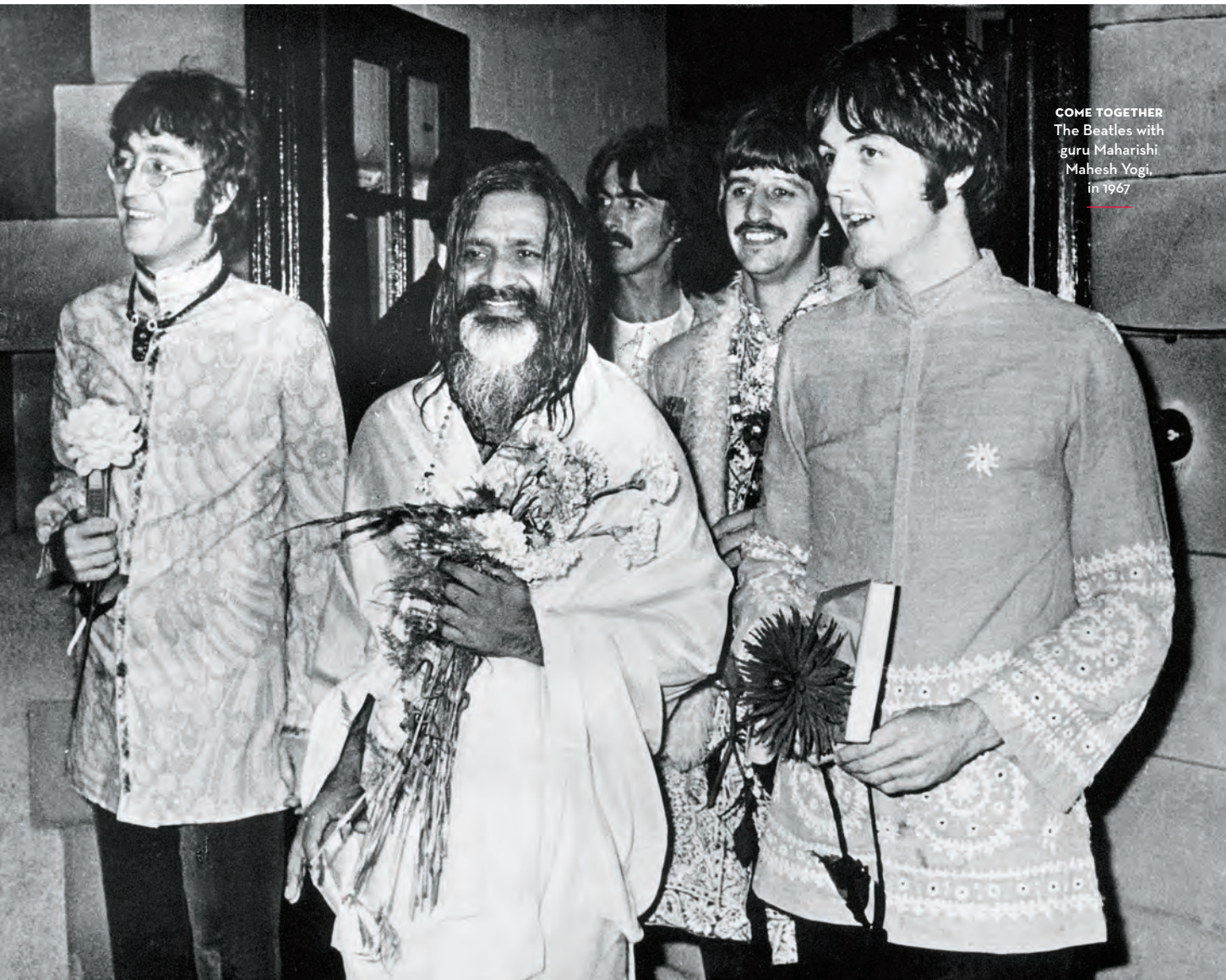
COME TOGETHER The Beatles with guru Maharishi Mahesh Yogi, in 1967

and actions. And, of course, who doesn't yearn for more joy, calm, and compassion in their personal lives? I liked that this technique could potentially tick all these boxes and then some. I practice yoga regularly and have dabbled in everything from astrology to reiki, but my past experience with meditation (a three-day silent Vipassana retreat where I sat for hours on end meditating cross-legged and remained mute between sittings), though it was awakening, was impossible to sustain in everyday life. In Vipassana, you concentrate on the rising and falling of the breath; no mantra is given. When friends started mentioning VM as the trick that keeps them sane and on their game, I was intrigued.