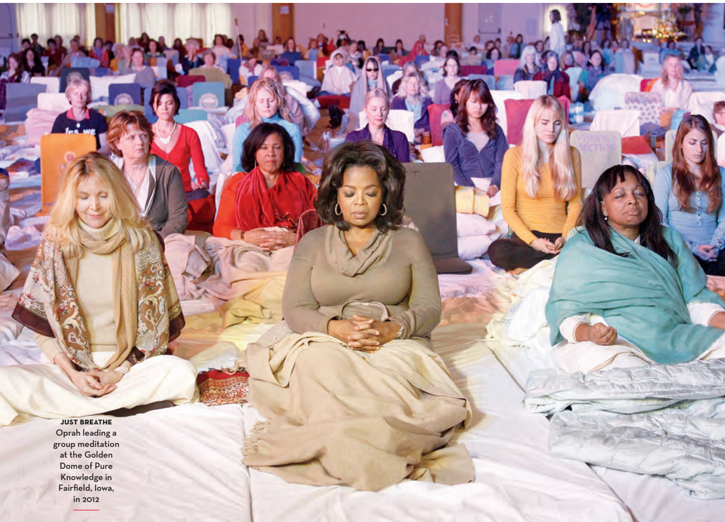
JUST BREATHE Oprah leading a group meditation at the Golden Dome of Pure Knowledge in Fairfield, Iowa, in 2012